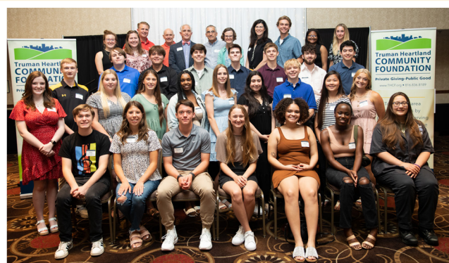
2023 Scholarship Ice Cream Social