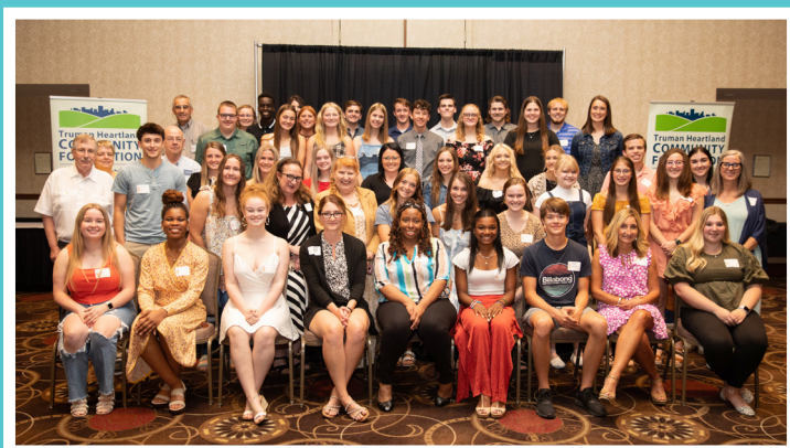
2022 Scholarship Awardees